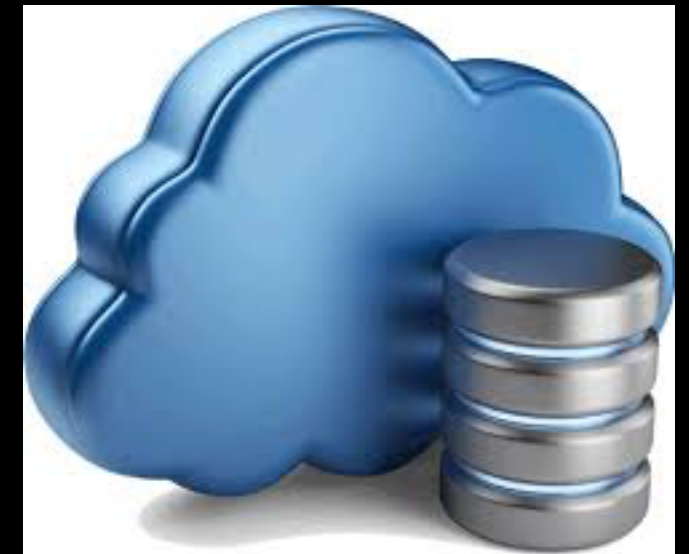
Cloud / DBaaS